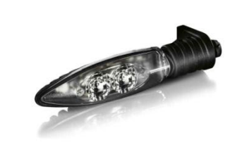
LED turn indicators