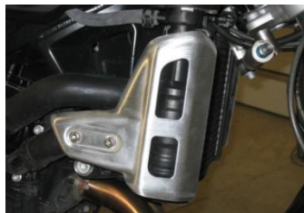
Radiator shroud, aluminium