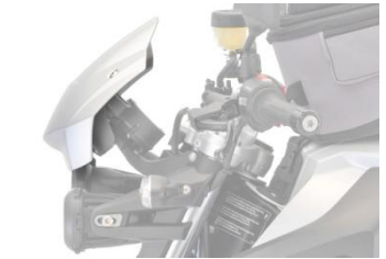
Sport windscreen painted in motorcycle colour