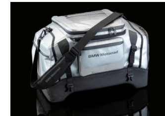
Sport softbag large / small