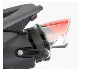
LED rear light