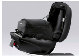
Inner bag for topcase