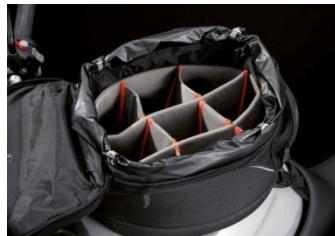
Vario insert tank rucksack