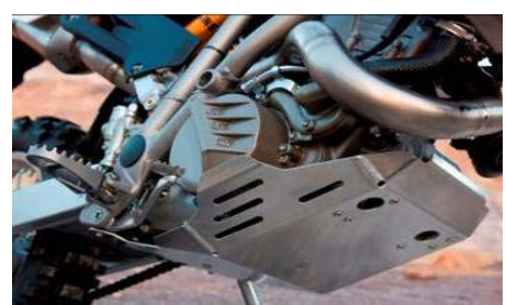
Aluminium engine guard