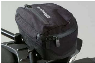
Enduro rear softbag