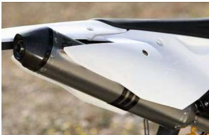
Akrapović® titanium racing silencer