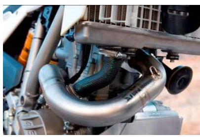
Akrapović® titanium racing header